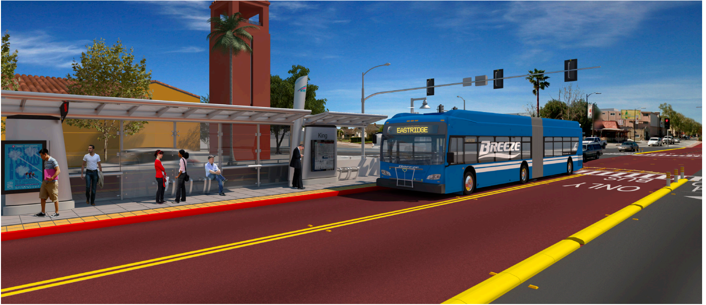
Proposed BRT station.

The El Camino Real BRT service will include the following: